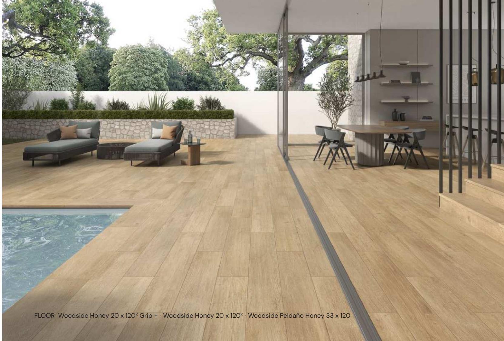
FLOOR Woodside Honey 20 x 120 R Grip + · Woodside Honey 20 x 120 R · Woodside Peldaño Honey 33 x 120