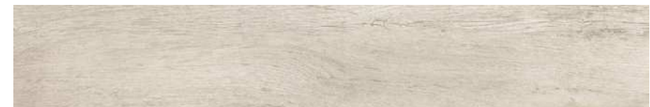
Woodside Natural 25 x 150 R 25 x 150 R Grip +