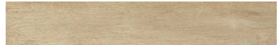
Woodside Honey 25 x 150 R 25 x 150 R Grip +