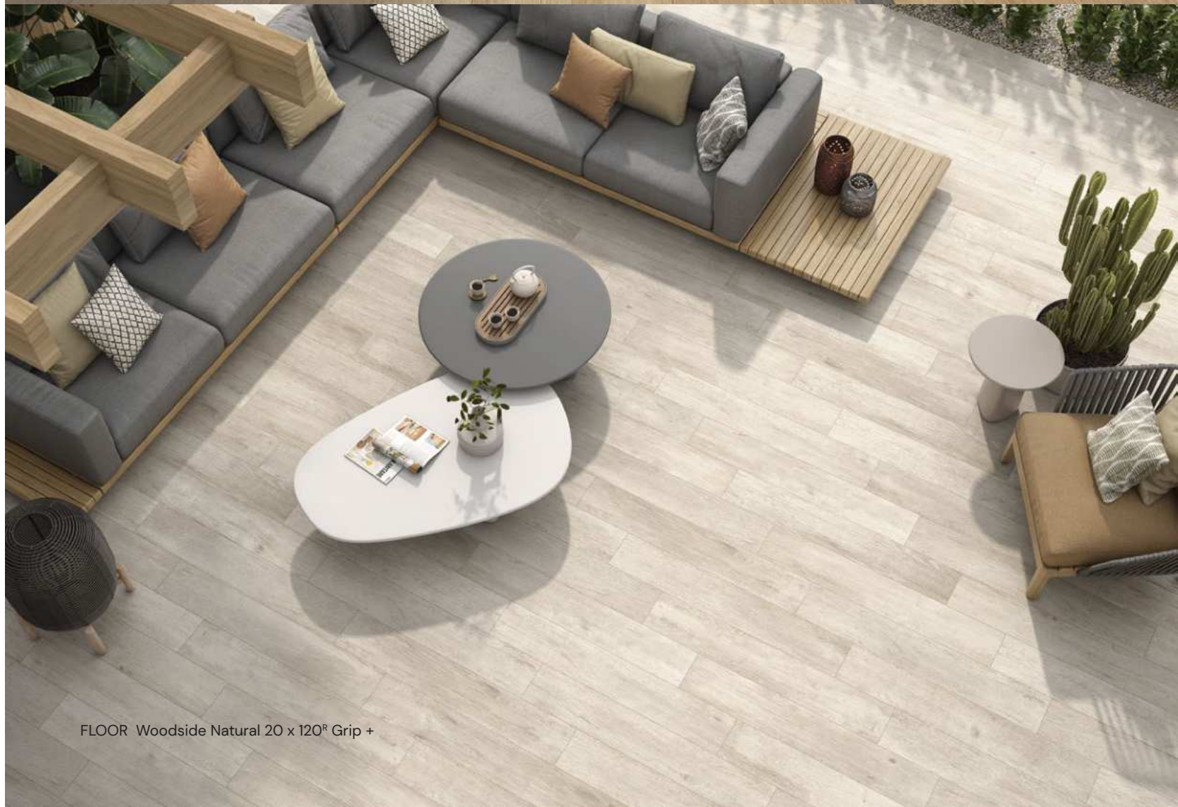
FLOOR Woodside Natural 20 x 120 R Grip +